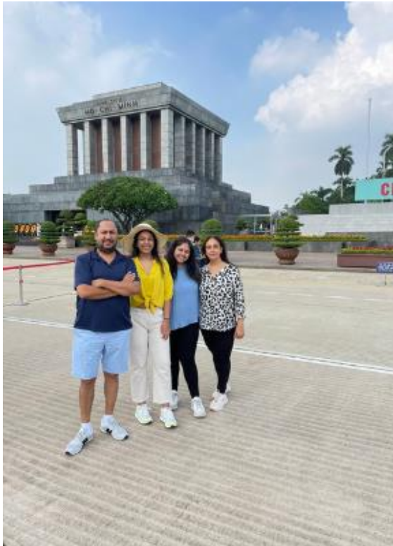
Ho Chi Minh Complex