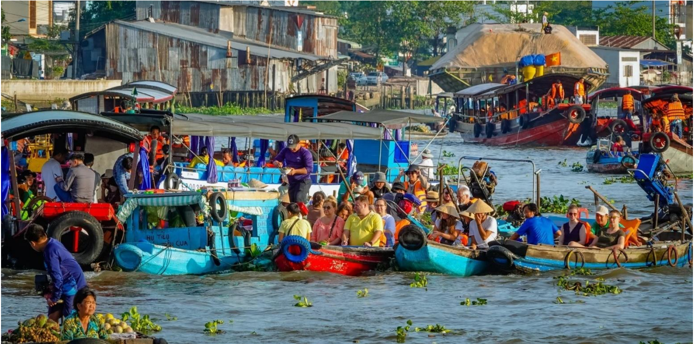
Cai Rang Market

The market is unique culture of local people living along this mighty river. Instead of shopping in the town, they shop and barter on the river that is more convenient to access by waterways.