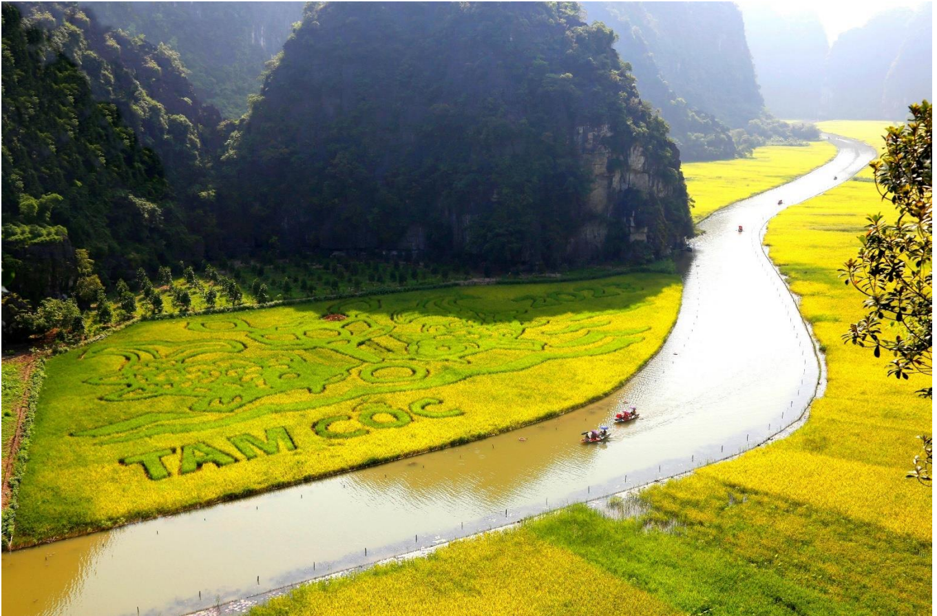
Trang An - Landscape Complex

Return to Hanoi in the late afternoon, have dinner at local restaurant, then transfer to Hanoi Railway Station for night train to Laocai