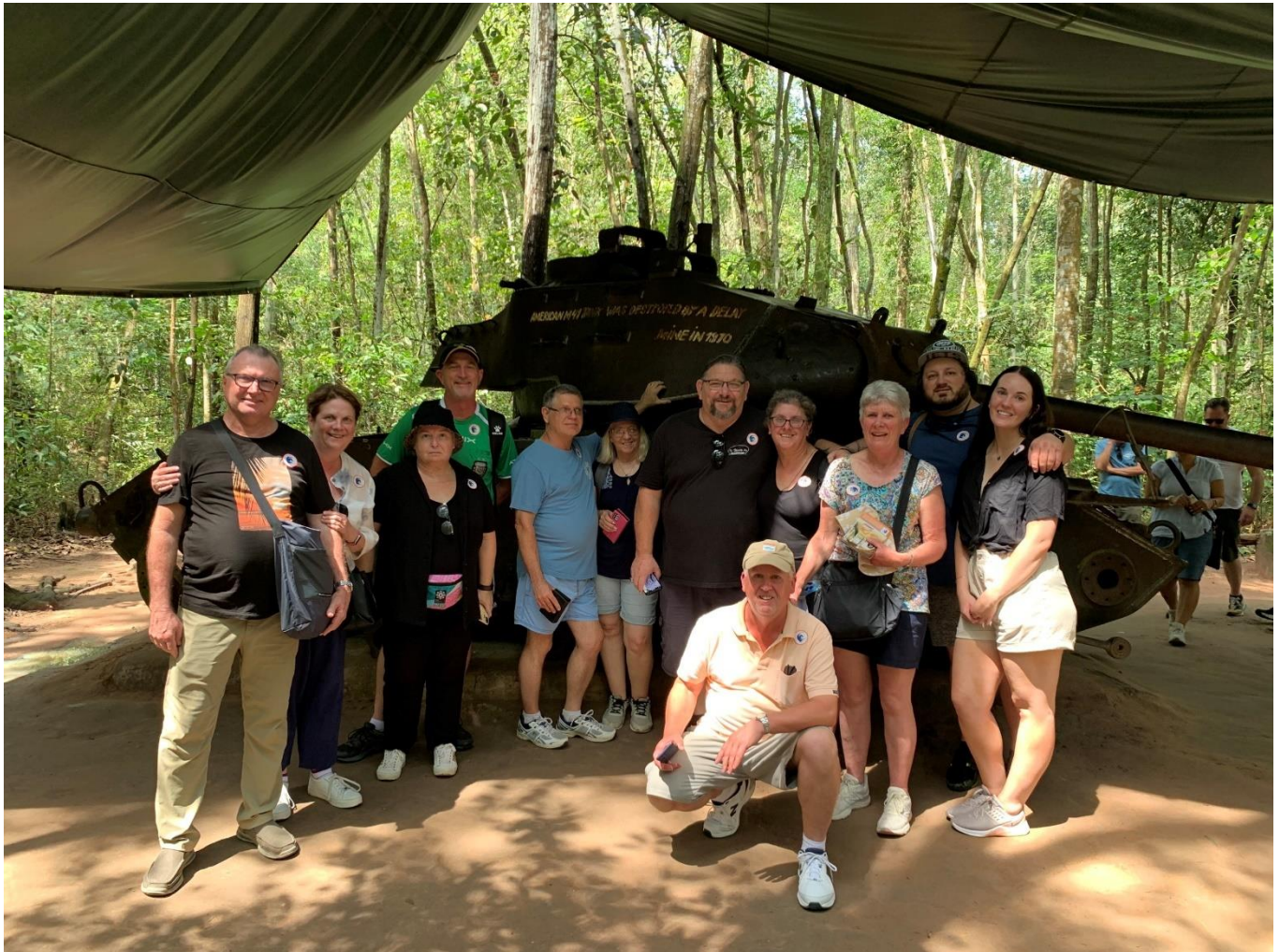
Cu Chi Tunnels

This morning we drive to Cao Dai Temples in Tay Ninh to observe the midday service. Near the Cambodian border, is home to the unique Cao Dai sect, whose patron saints include Joan of Arc, Victor Hugo and Winston Churchill to name a few. The trip to Tay Ninh is combined with a visit to the Cu Chi Tunnels ; the tunnel system stretched over 200km. The network included innumerable trap doors, specially constructed living areas, storage facilities, weapons factories, field hospitals, command centers and kitchens.