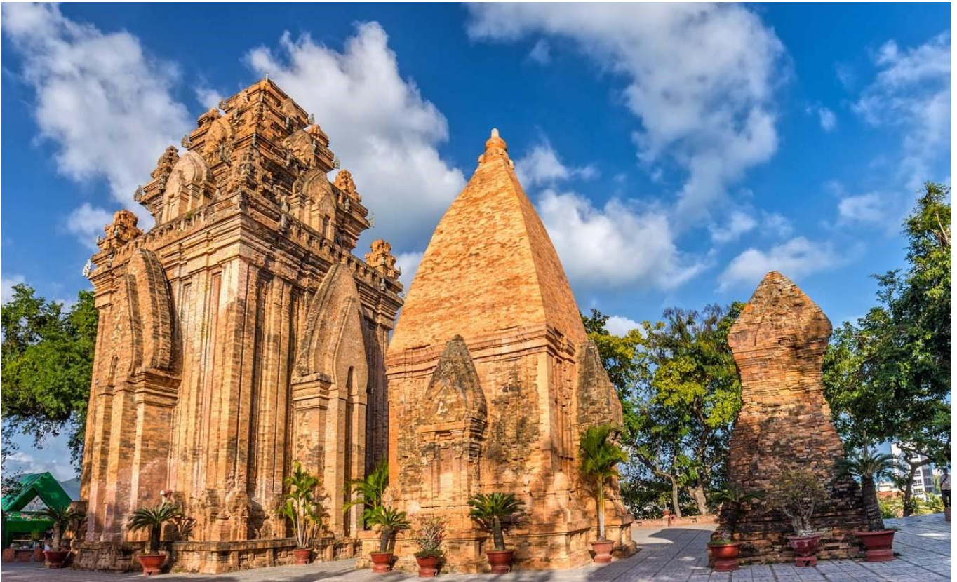
Po Nagar Towers

Then, visit the Po Nagar Towers , an outstanding of ancient Cham architecture.