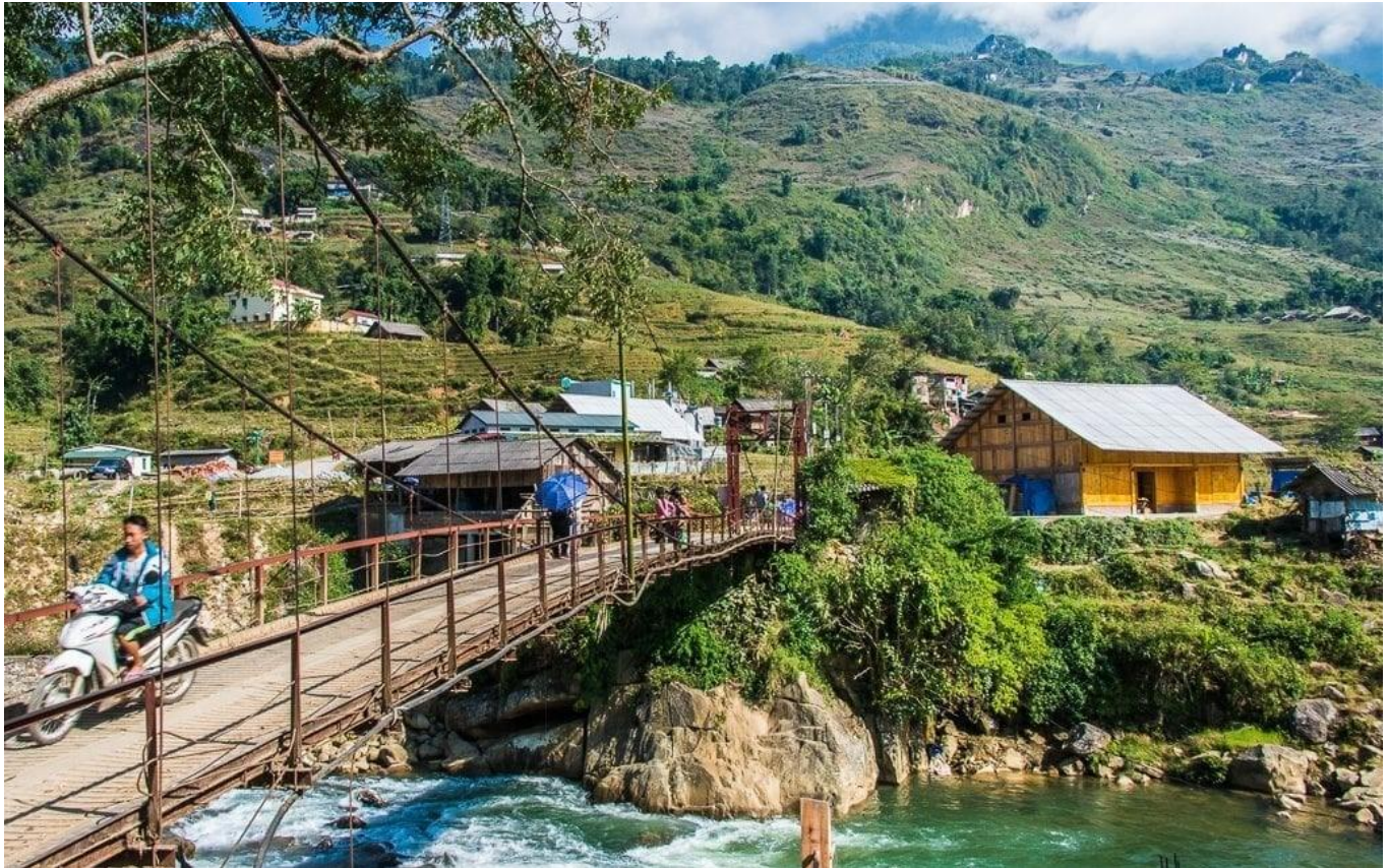
Cat Cat Village