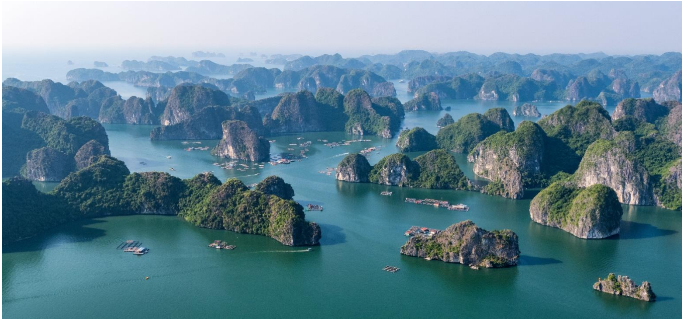
Ha Long Bay

Note: the itinerary of Halong will be changed based on which cruise you choose and depending on the weather without prior notice.