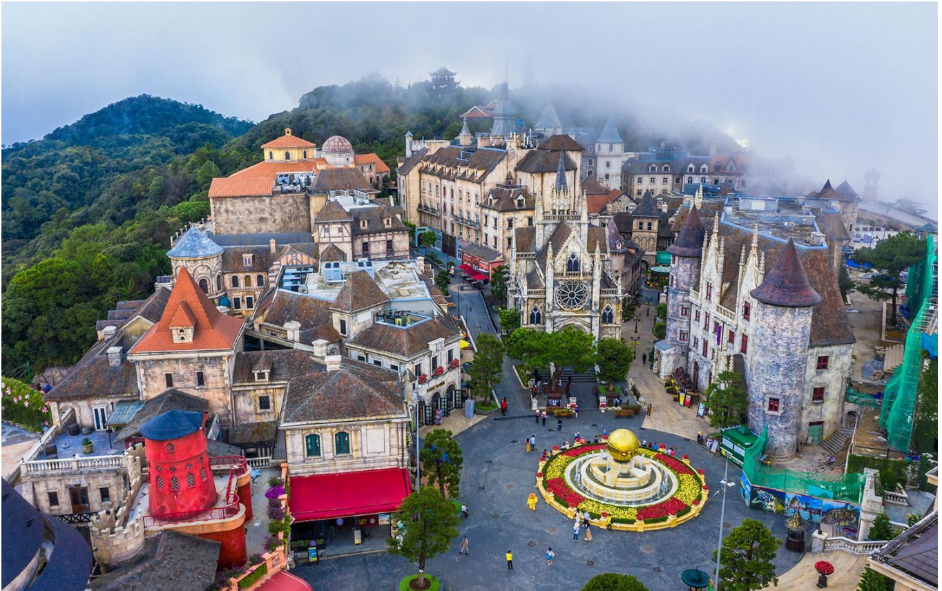
Ba Na Hills

Arrive at the cable car station Suoi Mo. Sitting in the cabin, in mid air, looking upon the endless tree lone of the forest. Experiencing the pristine ecological system of the Ba Na mountain will leave you a sense of unforeseeable discovery