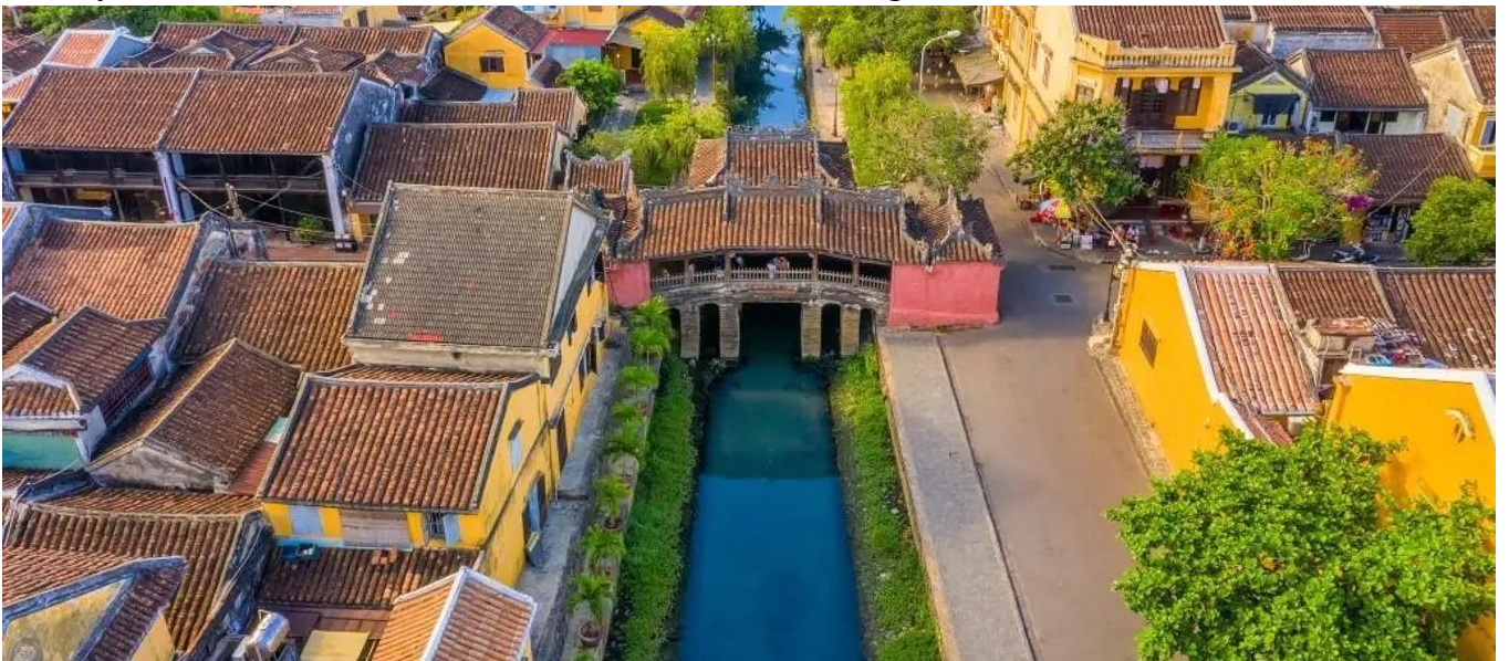
Japanese Covered Bridge Pagoda

At Leisure and then you will be taken to the airport in Nha Trang to take 1-hour flight to Da Nang City, where you will visit Marble Mountains en route to the charming Hoi An.