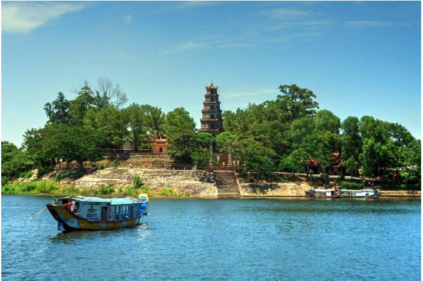
Thien Mu pagoda

Then, enjoy afternoon street food such as: “ Bun Bo Hue ”, “ Banh Nậm ”, “ Banh Khoai ”, “ Banh Beo ”, “ Nem Lui ” & “ Che Hem ”