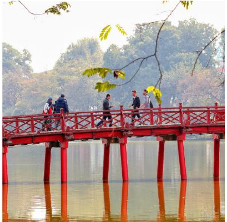
Ngoc Son Temple