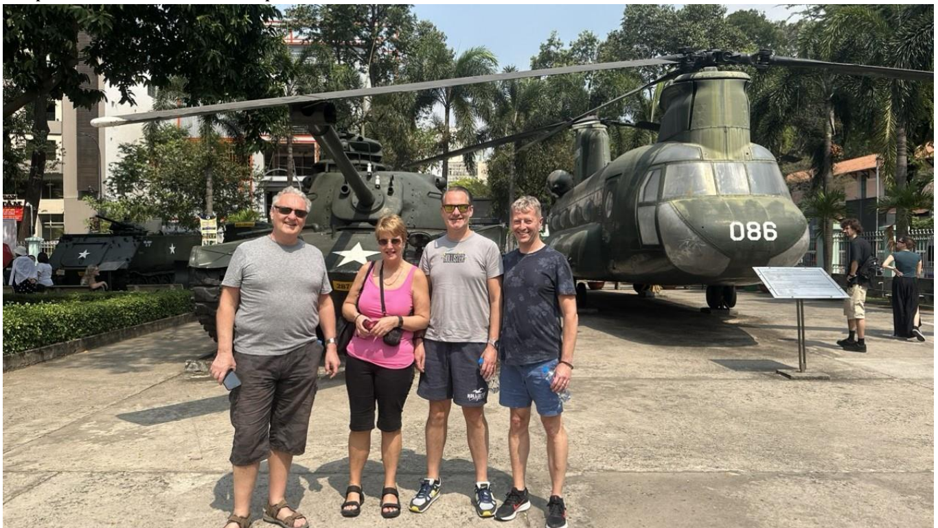
War Remnants Museum

Begin your experience in bustling Saigon, the country's commercial center and home to a growing number of upscale restaurants and shops.