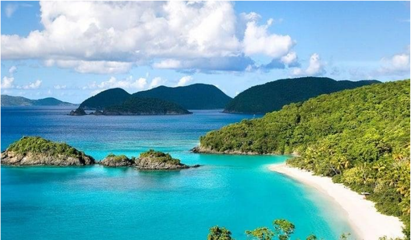
Hon Mun Island