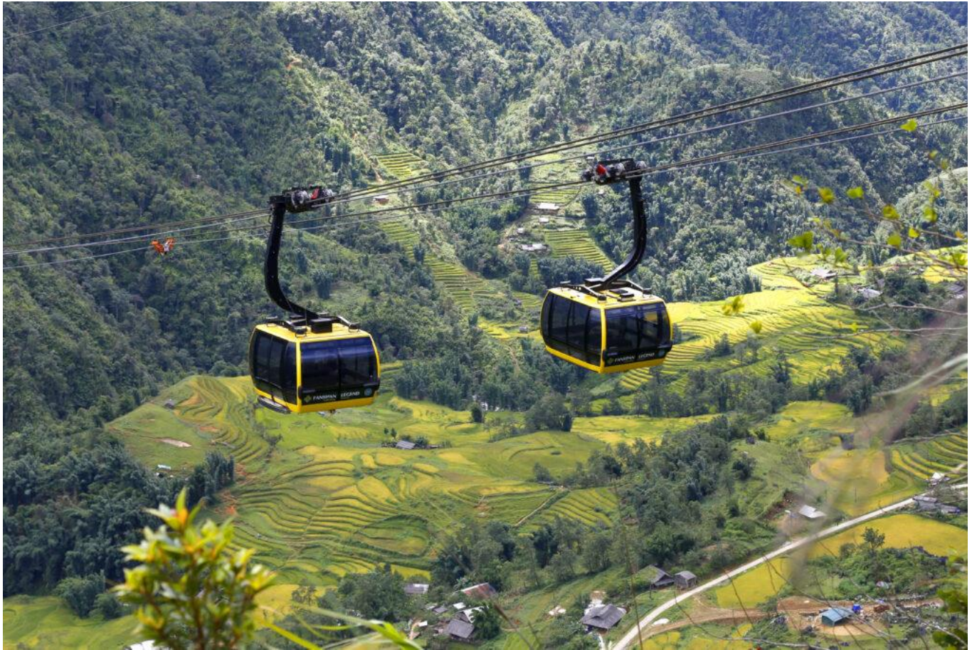
Fansipan Cable Car