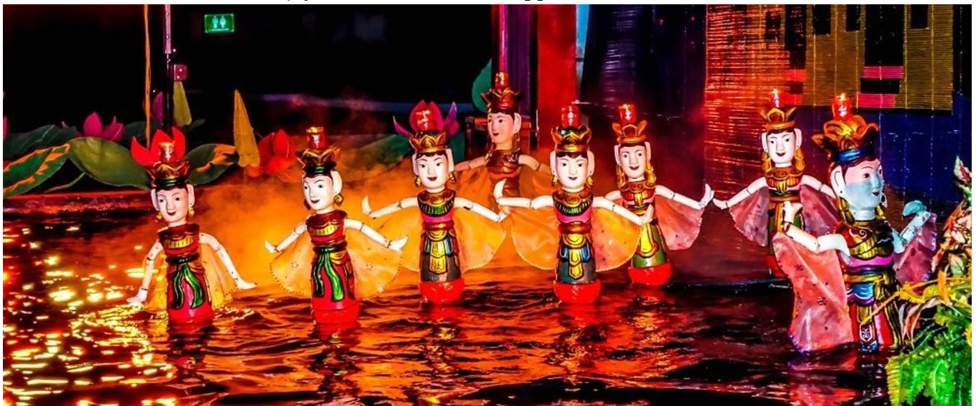
Water Puppet Show

Then, transfer back to Hanoi, enjoy Traditional Water Puppet Show