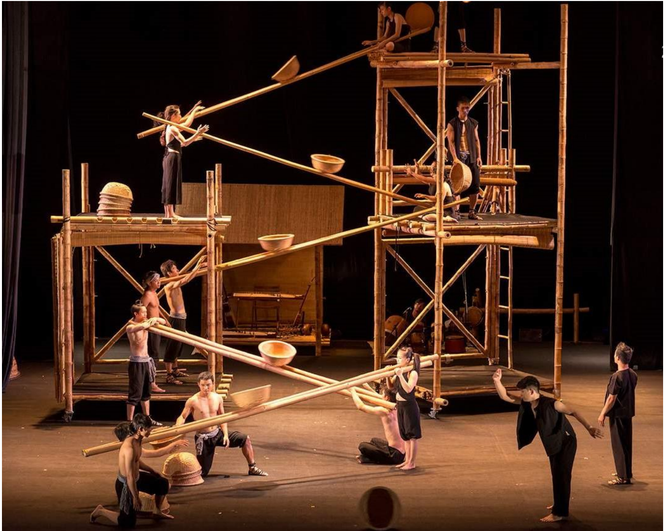
A O Show

Price: Kindly contact us for more detail